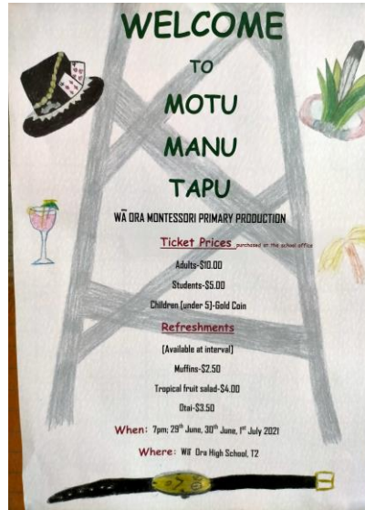
Tickets on sale at the office

All performances will be in T2 at the High School.