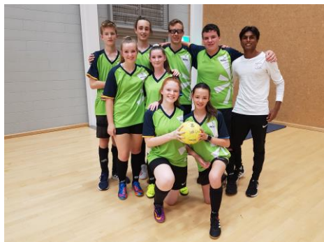
This term's senior futsal team.

Senior Mixed v Silverstream Silver, 3–5.